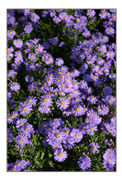
Blue Boy Aster flowers