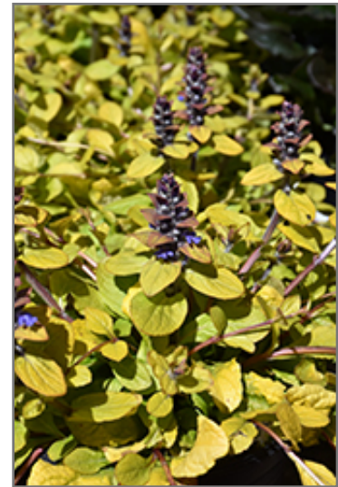
Feathered Friends Tropical Toucan Bugleweed flowers

This plant will require occasional maintenance and upkeep, and should not require much pruning, except when necessary, such as to remove dieback. It is a good choice for attracting butterflies to your yard, but is not particularly attractive to deer who tend to leave it alone in favor of tastier treats. Gardeners should be aware of the following characteristic(s) that may warrant special consideration;