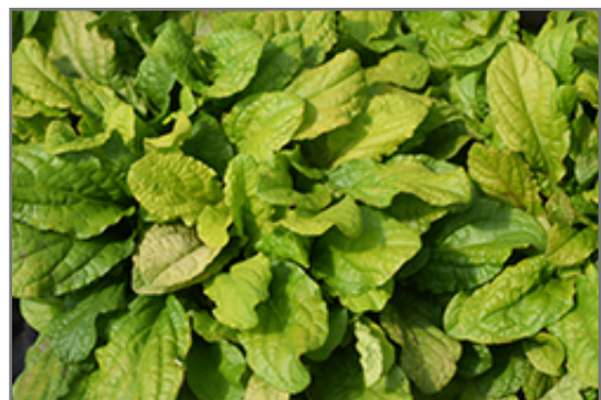
Feathered Friends Tropical Toucan Bugleweed foliage