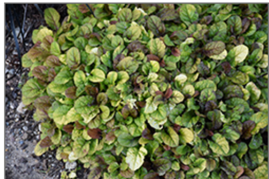
Feathered Friends Parrot Paradise Bugleweed