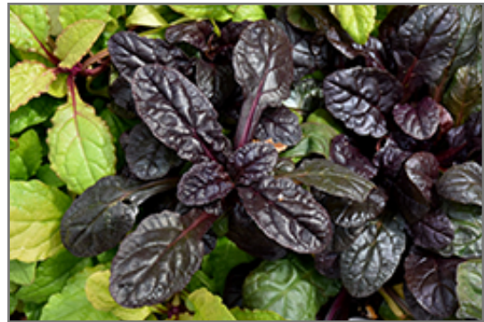
Feathered Friends Fierce Falcon Bugleweed foliage

Feathered Friends Fierce Falcon Bugleweed is recommended for the following landscape applications;