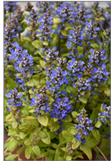
Feathered Friends Fancy Finch Bugleweed flowers

This plant will require occasional maintenance and upkeep, and should not require much pruning, except when necessary, such as to remove dieback. It is a good choice for attracting butterflies to your yard, but is not particularly attractive to deer who tend to leave it alone in favor of tastier treats. Gardeners should be aware of the following characteristic(s) that may warrant special consideration;