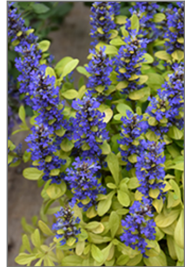
Feathered Friends Cordial Canary Bugleweed flowers

This plant will require occasional maintenance and upkeep, and should not require much pruning, except when necessary, such as to remove dieback. It is a good choice for attracting butterflies to your yard, but is not particularly attractive to deer who tend to leave it alone in favor of tastier treats. Gardeners should be aware of the following characteristic(s) that may warrant special consideration;