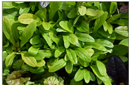
Feathered Friends Cordial Canary Bugleweed foliage