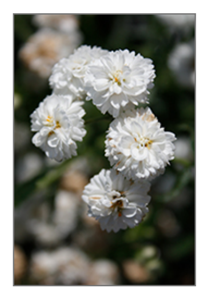
Diadem Double Yarrow flowers

Masses of double, snowy white, pompon shaped blooms fill the plant all summer, over a low, mounding habit of green foliage; low maintenance and easy to grow; an outstanding addition to the garden or containers