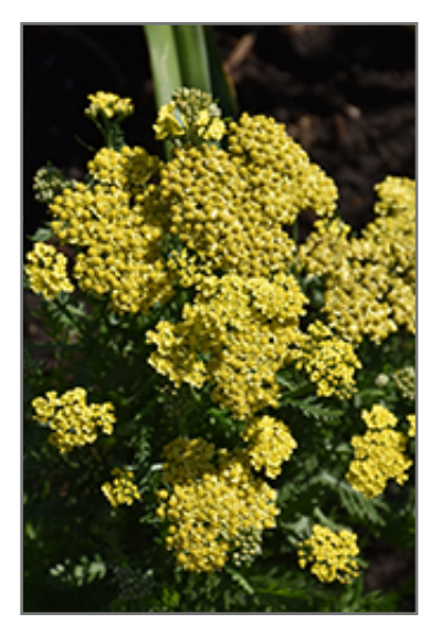
Firefly Sunshine Yarrow flowers

Luminous yellow flowers that remain attractive as they age, light up the garden all summer long; a vigorous selection with an upright habit and strong stems; excellent for xeriscaping and hot, sunny, dry locations in the garden