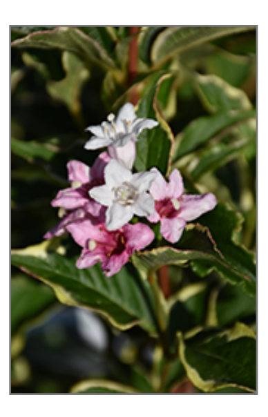
Suzanne Weigela flowers

Suzanne Weigela is covered in stunning clusters of pink trumpet-shaped flowers with white overtones along the branches in late spring. It has attractive forest green foliage edged in white. The pointy leaves are highly ornamental but do not develop any appreciable fall colour.