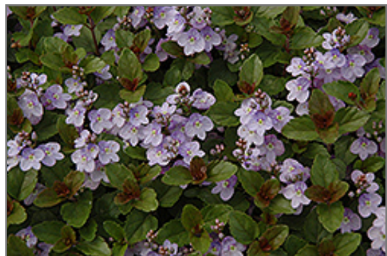
Waterperry Blue Speedwell flowers