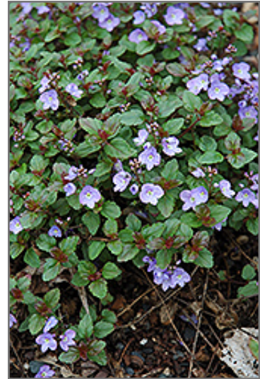
Waterperry Blue Speedwell in bloom