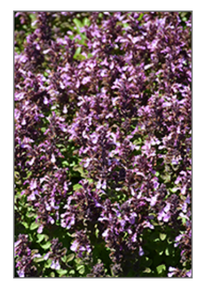
Pride Of Georgia Germander flowers

Pride Of Georgia Germander is an herbaceous evergreen perennial with a mounded form. Its relatively fine texture sets it apart from other garden plants with less refined foliage.