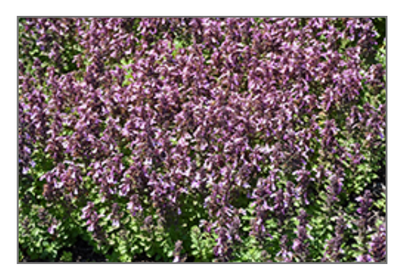
Pride Of Georgia Germander in bloom

This is a relatively low maintenance plant, and is best cleaned up in early spring before it resumes active growth for the season. It is a good choice for attracting bees and butterflies to your yard, but is not particularly attractive to deer who tend to leave it alone in favor of tastier treats. It has no significant negative characteristics.