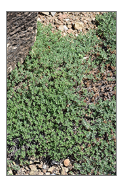
Mountain Germander