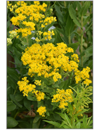
Golden Rockets Goldenrod flowers

Golden Rockets Goldenrod is an herbaceous perennial with an upright spreading habit of growth. Its medium texture blends into the garden, but can always be balanced by a couple of finer or coarser plants for an effective composition.