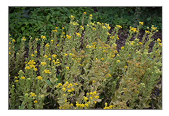
Golden Rockets Goldenrod in bloom

This plant will require occasional maintenance and upkeep, and is best cleaned up in early spring before it resumes active growth for the season. It is a good choice for attracting bees and butterflies to your yard, but is not particularly attractive to deer who tend to leave it alone in favor of tastier treats. Gardeners should be aware of the following characteristic(s) that may warrant special consideration;