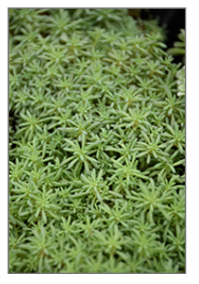
Blue Carpet Spanish Stonecrop foliage

A compact, mat-forming variety presenting whorls of small, cylindrical pale blue to gray-green leaves that will flush purple in winter; clusters of pink flowers appear in summer; a very attractive groundcover with a fine texture