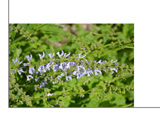
Ballet Sky Dance Sage flowers

Ballet Sky Dance Sage has masses of beautiful spikes of sky blue flowers rising above the foliage from late spring to early fall, which are most effective when planted in groupings. The flowers are excellent for cutting. Its attractive fragrant narrow leaves emerge light green in spring, turning grayish green in colour throughout the season.