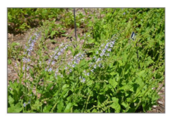
Ballet Sky Dance Sage in bloom