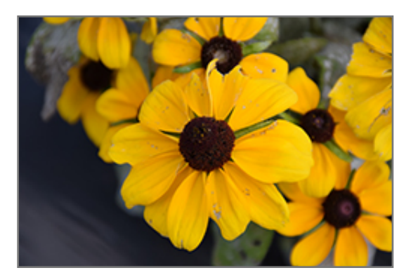
Toto Gold Coneflower flowers

This is a relatively low maintenance plant, and should be cut back in late fall in preparation for winter. It is a good choice for attracting butterflies to your yard, but is not particularly attractive to deer who tend to leave it alone in favor of tastier treats. It has no significant negative characteristics.