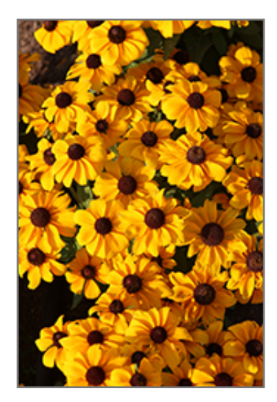
Toto Gold Coneflower flowers

Toto Gold Coneflower is an herbaceous perennial with an upright spreading habit of growth. Its medium texture blends into the garden, but can always be balanced by a couple of finer or coarser plants for an effective composition.