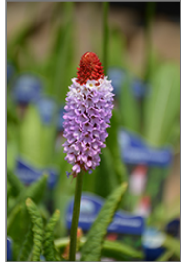
Orchid Primrose flowers

This is a relatively low maintenance plant, and should be cut back in late fall in preparation for winter. It is a good choice for attracting bees and butterflies to your yard, but is not particularly attractive to deer who tend to leave it alone in favor of tastier treats. It has no significant negative characteristics.