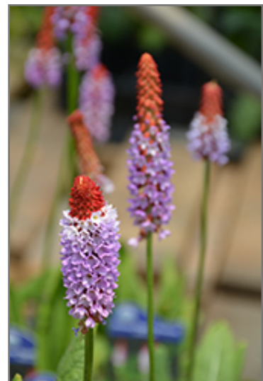
Orchid Primrose flowers