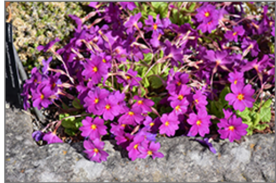
Julia's Primrose in bloom

Other Names: Juliae Primrose, Juliana Primrose