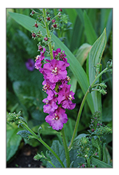
Purple Mullein flowers

Purple Mullein has masses of beautiful spikes of purple flowers with white anthers rising above the foliage from mid spring to mid summer, which are most effective when planted in groupings. The flowers are excellent for cutting. Its oval leaves remain dark green in colour throughout the season.