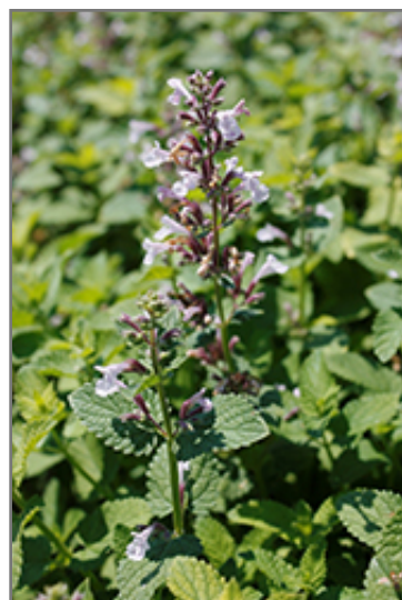
Whispurr Pink Catmint flowers