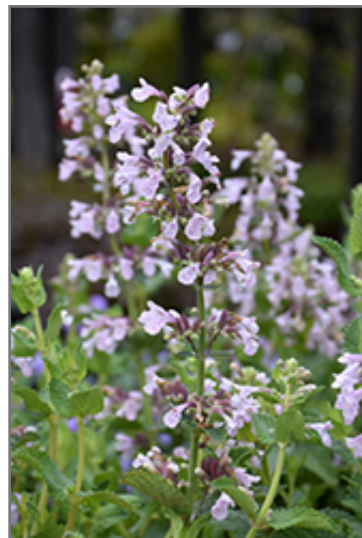
Whispurr Pink Catmint flowers