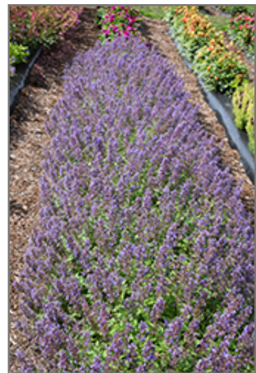
Whispurr Blue Catmint in bloom