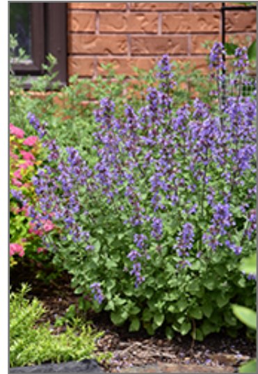
Picture Purrfect Catmint flowers

Picture Purrfect Catmint is a dense herbaceous perennial with a mounded form. Its relatively fine texture sets it apart from other garden plants with less refined foliage.