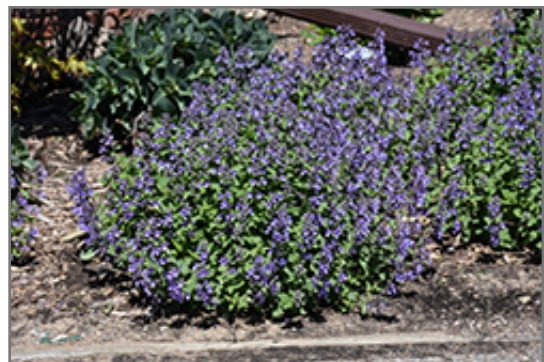
Picture Purrfect Catmint in bloom