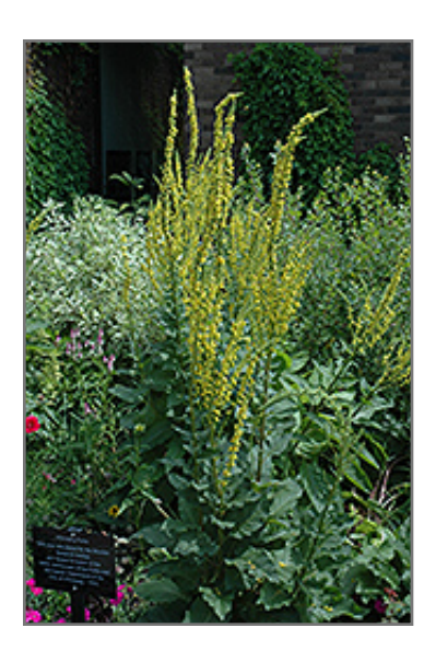
Dark Mullein flowers