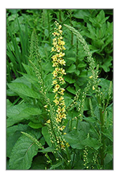
Dark Mullein flowers