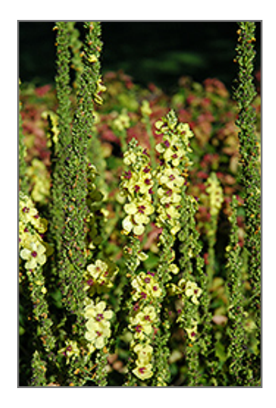
Turkish Mullein flowers

Turkish Mullein has masses of beautiful spikes of lemon yellow flowers with burgundy anthers rising above the foliage from late spring to late summer, which are most effective when planted in groupings. The flowers are excellent for cutting. Its attractive tomentose round leaves emerge silver in spring, turning gray in colour throughout the season.