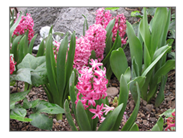
Pink Frosting Hyacinth in bloom

Pink Frosting Hyacinth is recommended for the following landscape applications;