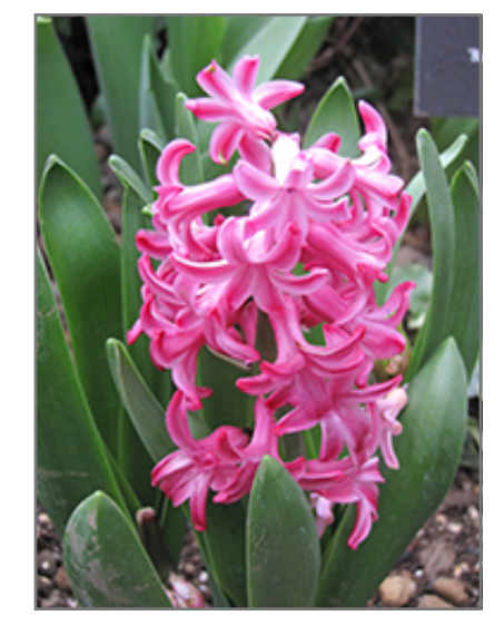
Pink Frosting Hyacinth flowers

This is a relatively low maintenance plant, and usually looks its best without pruning, although it will tolerate pruning. It has no significant negative characteristics.