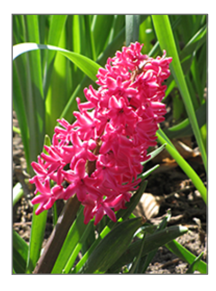
Jan Bos Hyacinth flowers

Jan Bos Hyacinth is recommended for the following landscape applications;