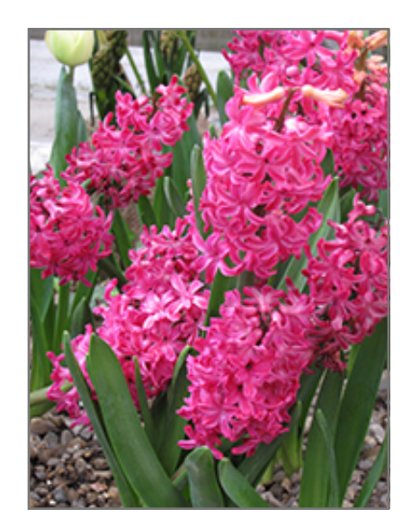
Jan Bos Hyacinth in bloom