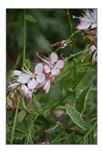
Freefolk Rosy Gaura flowers