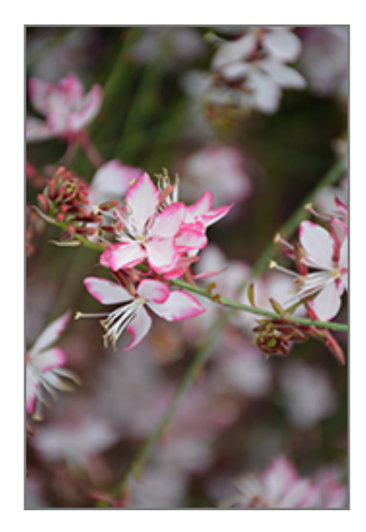
Freefolk Rosy Gaura flowers

This is a relatively low maintenance plant, and is best cleaned up in early spring before it resumes active growth for the season. It is a good choice for attracting butterflies to your yard, but is not particularly attractive to deer who tend to leave it alone in favor of tastier treats. It has no significant negative characteristics.