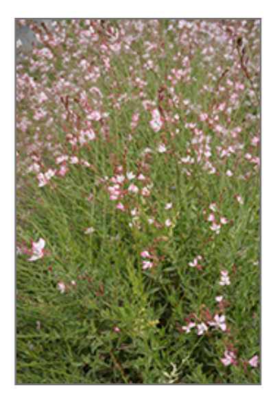
Freefolk Rosy Gaura in bloom

Freefolk Rosy Gaura will grow to be about 12 inches tall at maturity extending to 24 inches tall with the flowers, with a spread of 24 inches. When grown in masses or used as a bedding plant, individual plants should be spaced approximately 18 inches apart. Its foliage tends to remain dense right to the ground, not requiring facer plants in front. It grows at a fast rate, and under ideal conditions can be expected to live for approximately 8 years. As an herbaceous perennial, this plant will usually die back to the crown each winter, and will regrow from the base each spring. Be careful not to disturb the crown in late winter when it may not be readily seen!