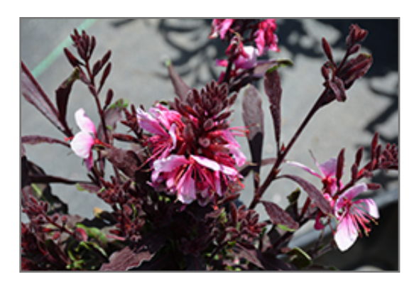
Bantam Pink Gaura flowers