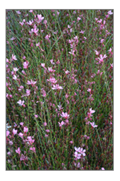
Bantam Pink Gaura in bloom

Bantam Pink Gaura is an open herbaceous perennial with tall flower stalks held atop a low mound of foliage. It brings an extremely fine and delicate texture to the garden composition and should be used to full effect.