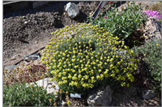
Kannah Creek Sulphur Flower Buckwheat in bloom

Kannah Creek Sulphur Flower Buckwheat is recommended for the following landscape applications;