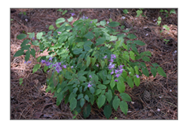
Shadow Dancer Barrenwort in bloom