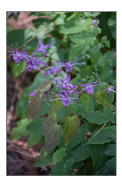
Shadow Dancer Barrenwort flowers

This plant will require occasional maintenance and upkeep, and is best cleaned up in early spring before it resumes active growth for the season. It is a good choice for attracting bees to your yard, but is not particularly attractive to deer who tend to leave it alone in favor of tastier treats. Gardeners should be aware of the following characteristic(s) that may warrant special consideration;