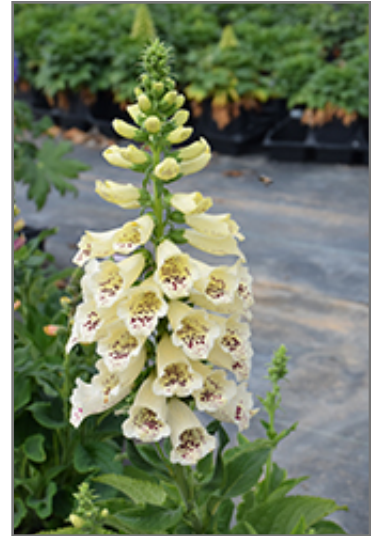
Dalmatian Creme Foxglove flowers