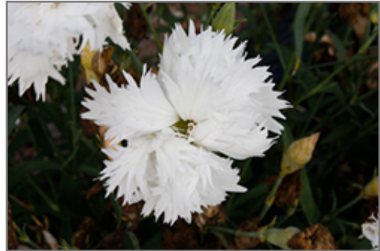
Elegance White Pinks flowers

Elegance White Pinks is recommended for the following landscape applications;