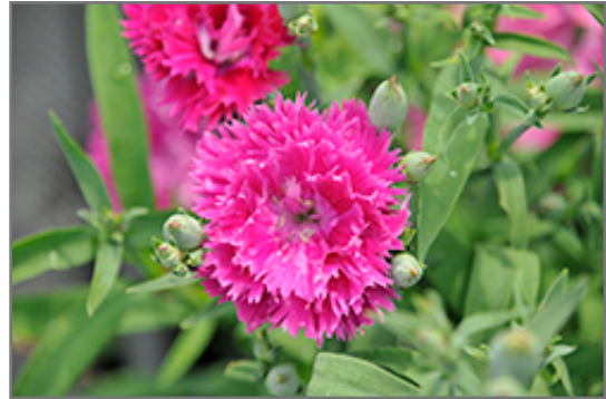
Elegance Lavender Pinks flowers

Elegance Lavender Pinks is recommended for the following landscape applications;