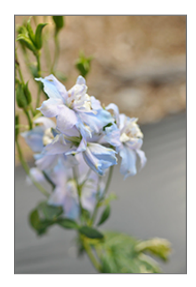
Magic Fountains Sky Blue White Bee Larkspur flowers