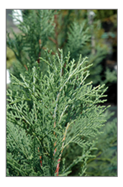
MacNab Cypress foliage

An upright, conical accent tree, presenting wonderfully fine, gray-green foliage arranged in flattened sprays, giving a soft appearance; use as a solitary accent in the yard or a large garden, very hard to miss all season long