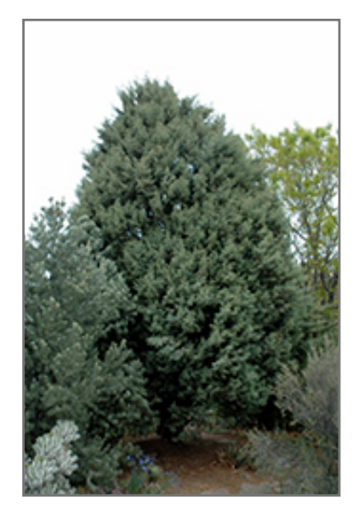
Observatory Arizona Cypress