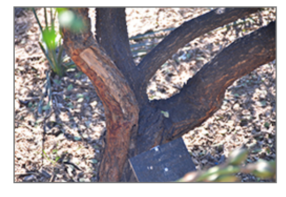
Smoothie Thornless Cascalote bark

Smoothie Thornless Cascalote is a fine choice for the yard, but it is also a good selection for planting in outdoor pots and containers. Its large size and upright habit of growth lend it for use as a solitary accent, or in a composition surrounded by smaller plants around the base and those that spill over the edges. It is even sizeable enough that it can be grown alone in a suitable container. Note that when grown in a container, it may not perform exactly as indicated on the tag - this is to be expected. Also note that when growing plants in outdoor containers and baskets, they may require more frequent waterings than they would in the yard or garden. Be aware that in our climate, most plants cannot be expected to survive the winter if left in containers outdoors, and this plant is no exception. Contact our experts for more information on how to protect it over the winter months.