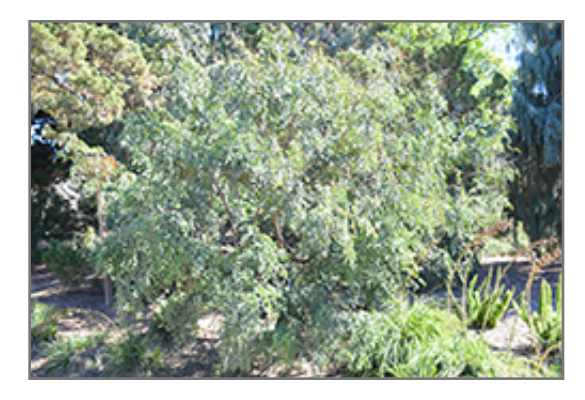
Smoothie Thornless Cascalote

This plant is native to the tropics and prefers growing in moist environments with evenly warm conditions all year round. In our climate, it is usually grown as an outdoor annual in the garden or in a container. If you want it to survive the winter, it can be brought in to the house and provided with special care, and then returned to the garden the following season. In its preferred tropical habitat, as a tree it can grow to be around 18 feet tall at maturity, with a spread of 18 feet. However, when grown as an annual or when overwintered indoors, it can be expected to perform quite differently, and its exact height and spread will depend on many factors; you may wish to consult with our experts as to how it might perform in your specific application and growing conditions.