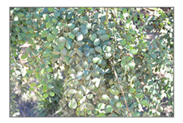
Smoothie Thornless Cascalote foliage