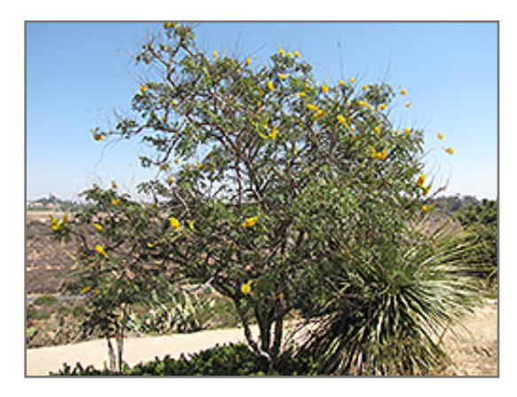
Cascalote in bloom