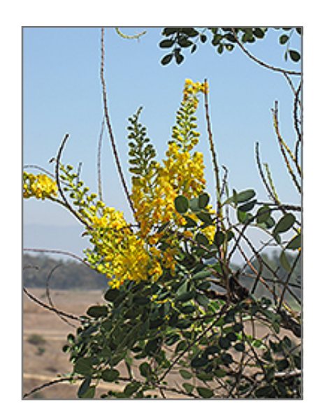
Cascalote flowers

This plant is native to the tropics and prefers growing in moist environments with evenly warm conditions all year round. In our climate, it is usually grown as an outdoor annual in the garden or in a container. If you want it to survive the winter, it can be brought in to the house and provided with special care, and then returned to the garden the following season. In its preferred tropical habitat, as a tree it can grow to be around 20 feet tall at maturity, with a spread of 18 feet. However, when grown as an annual or when overwintered indoors, it can be expected to perform quite differently, and its exact height and spread will depend on many factors; you may wish to consult with our experts as to how it might perform in your specific application and growing conditions.