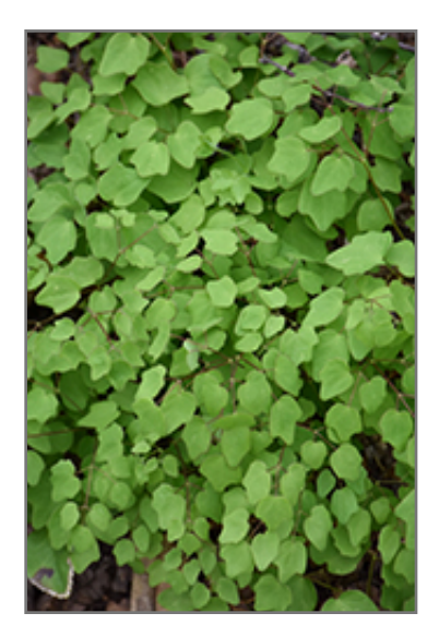
White Inside-Out Flower foliage

White Inside-Out Flower is recommended for the following landscape applications;