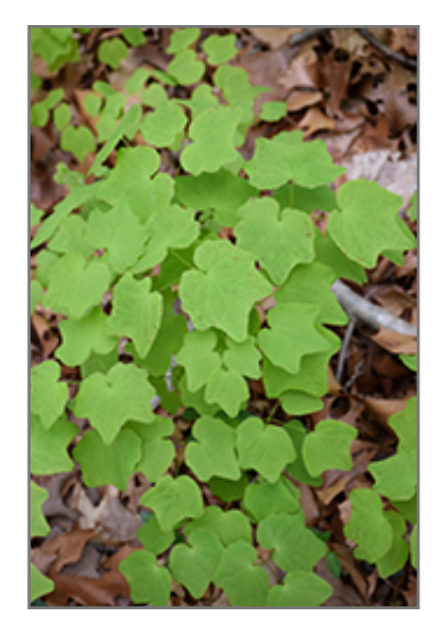
White Inside-Out Flower