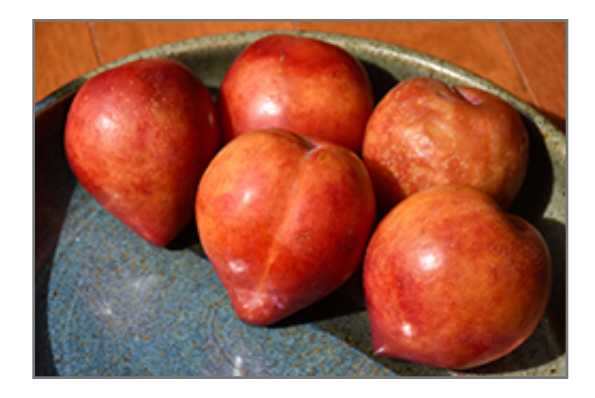
Elephant Heart Plum fruit