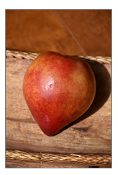
Elephant Heart Plum fruit