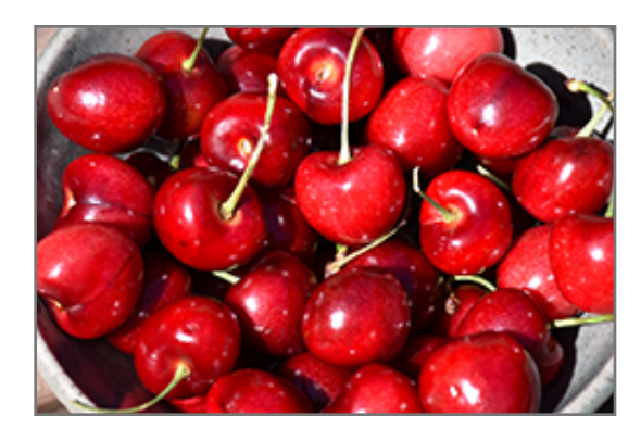
Summit Cherry fruit

Summit Cherry is smothered in stunning clusters of fragrant white flowers hanging below the branches in early spring before the leaves. It has dark green deciduous foliage. The pointy leaves turn yellow in fall. The fruits are showy cherry red drupes carried in abundance in early summer. The fruit can be messy if allowed to drop on the lawn or walkways, and may require occasional clean-up. The smooth dark red bark adds an interesting dimension to the landscape.