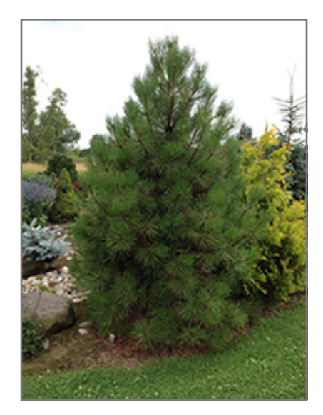
Washoe Pine