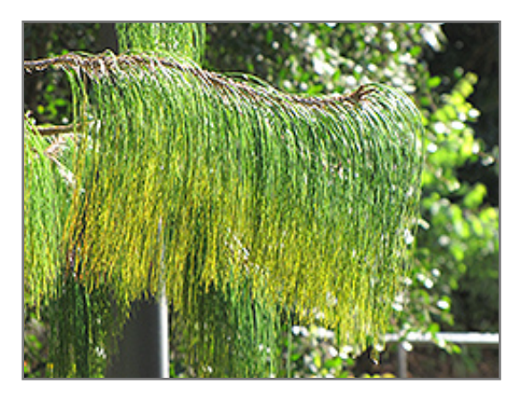
Mexican Weeping Pine foliage

Mexican Weeping Pine is recommended for the following landscape applications;