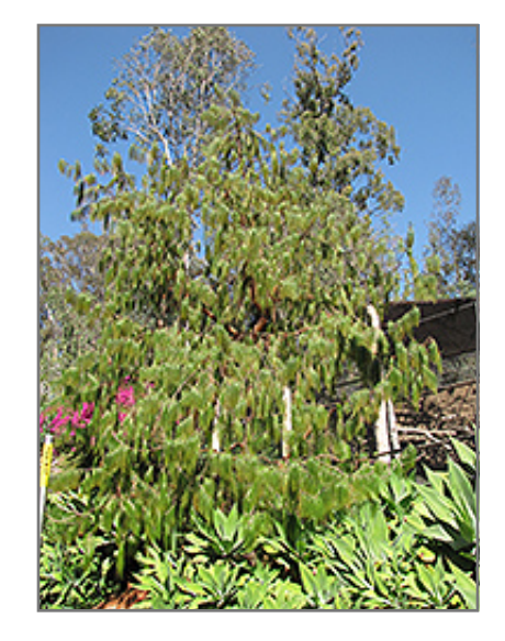
Mexican Weeping Pine