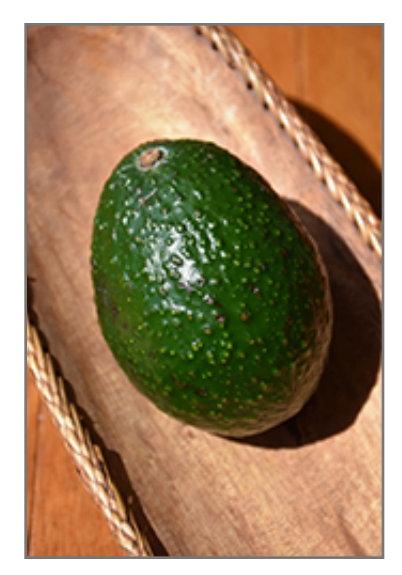
Hass Avocado fruit