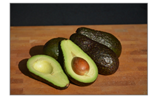
Hass Avocado fruit and flesh