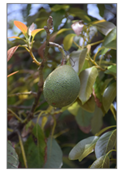
Hass Avocado fruit

This is an evergreen tree with an upright spreading habit of growth. Its average texture blends into the landscape, but can be balanced by one or two finer or coarser trees or shrubs for an effective composition. This is a high maintenance plant that will require regular care and upkeep, and should only be pruned after flowering to avoid removing any of the current season's flowers. It is a good choice for attracting bees, butterflies and squirrels to your yard. Gardeners should be aware of the following characteristic(s) that may warrant special consideration;