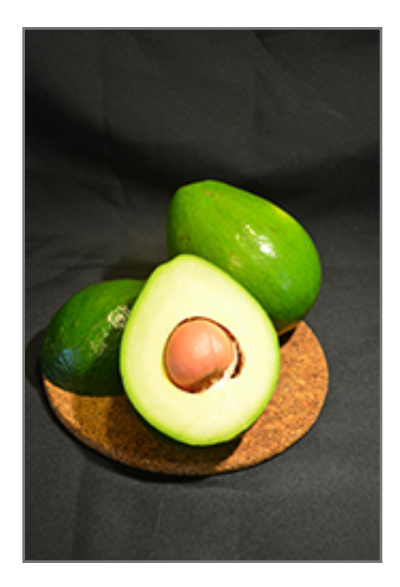
Choquette Avocado fruit and flesh

Choquette Avocado has attractive dark green evergreen foliage which emerges coppery-bronze in spring on a tree with an upright spreading habit of growth. The glossy oval compound leaves are highly ornamental and remain dark green throughout the winter. It features subtle clusters of fragrant chartreuse star-shaped flowers with green overtones at the ends of the branches in mid spring. The fruits are showy dark green drupes with a deep purple blush and which fade to black over time, which are displayed in mid summer. The fruit can be messy if allowed to drop on the lawn or walkways, and may require occasional clean-up. The rough brown bark adds an interesting dimension to the landscape.