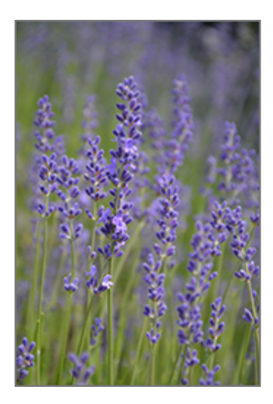
Royal Purple Lavender flowers

Royal Purple Lavender is recommended for the following landscape applications;