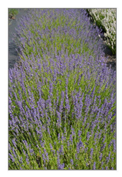
Royal Purple Lavender in bloom