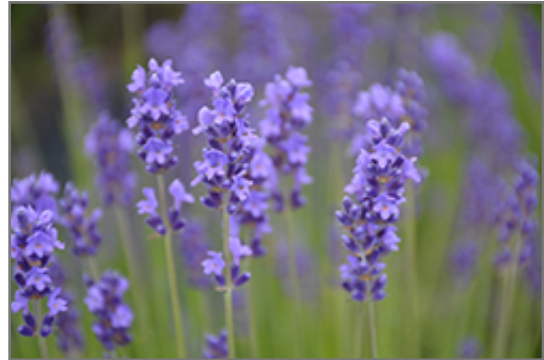
Purple Bouquet Lavender flowers

Purple Bouquet Lavender is a dense multi-stemmed evergreen shrub with a mounded form. It lends an extremely fine and delicate texture to the landscape composition which should be used to full effect.