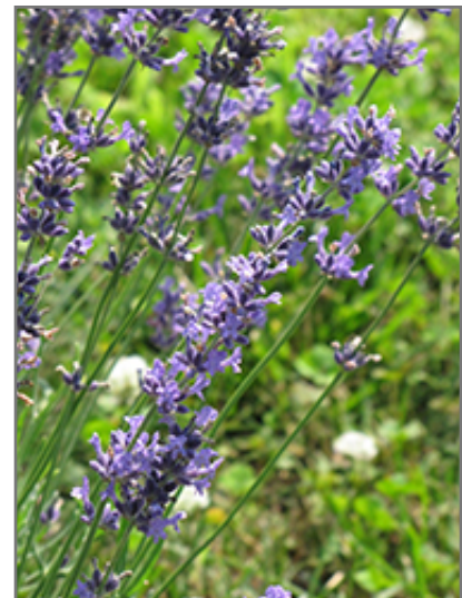
Purple Bouquet Lavender flowers