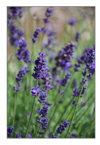
Blue Jeans Lavender flowers

Blue Jeans Lavender is recommended for the following landscape applications;