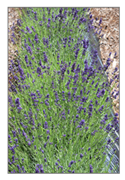
Blue Jeans Lavender in bloom