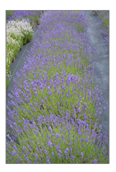
Betty's Blue Lavender in bloom

Betty's Blue Lavender makes a fine choice for the outdoor landscape, but it is also well-suited for use in outdoor pots and containers. It can be used either as 'filler' or as a 'thriller' in the 'spiller-thriller-filler' container combination, depending on the height and form of the other plants used in the container planting. It is even sizeable enough that it can be grown alone in a suitable container. Note that when grown in a container, it may not perform exactly as indicated on the tag - this is to be expected. Also note that when growing plants in outdoor containers and baskets, they may require more frequent waterings than they would in the yard or garden. Be aware that in our climate, most plants cannot be expected to survive the winter if left in containers outdoors, and this plant is no exception. Contact our experts for more information on how to protect it over the winter months.