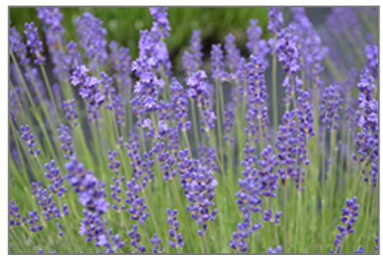
Betty's Blue Lavender flowers

Betty's Blue Lavender is a dense multi-stemmed evergreen shrub with a mounded form. It lends an extremely fine and delicate texture to the landscape composition which should be used to full effect.