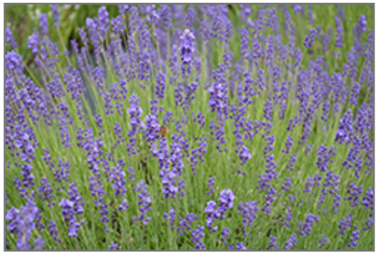
Betty's Blue Lavender flowers