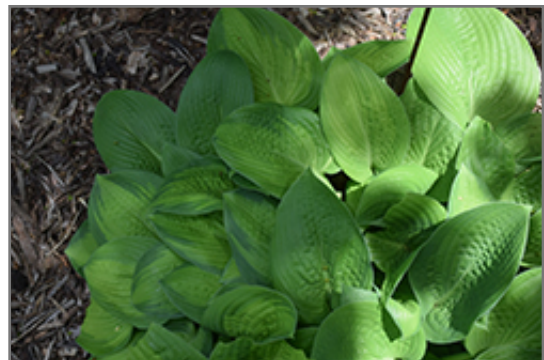
Tokudama Hosta