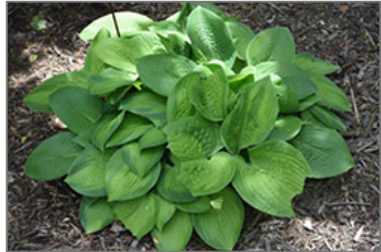
Tokudama Hosta

Tokudama Hosta is recommended for the following landscape applications;